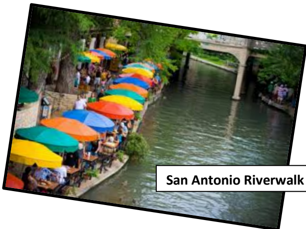
San Antonio Riverwalk