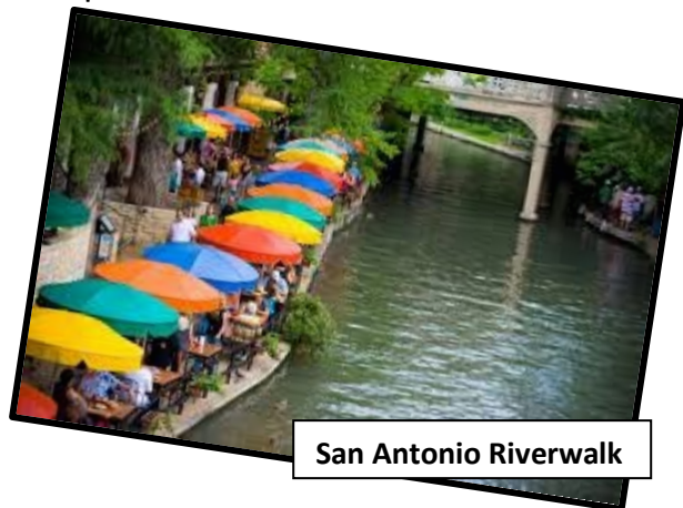
San Antonio Riverwalk