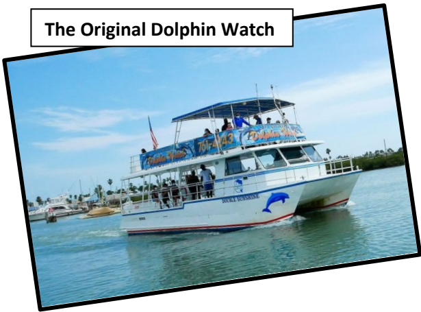
The Original Dolphin Watch