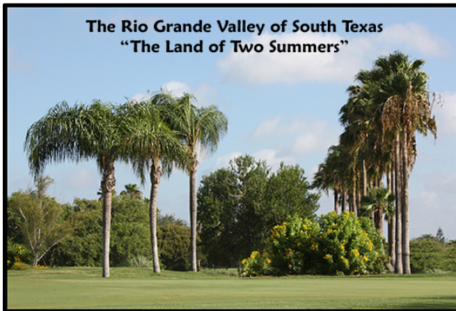
The Rio Grande Valley of South Texas "The Land of Two Summers"

*In the event that Hart Travel needs to cancel this trip, all payments will be refunded in full.